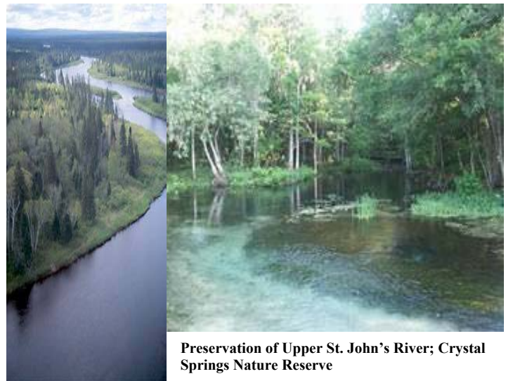
Preservation of Upper St. John's River; Crystal Springs Nature Reserve

NWNA is committed to preserving open space and allowing for public use of land where possible. There are many examples of how we provide for healthy open space, from a 54-acre conservation easement in Pennsylvania, to sponsoring a 525-acre nature preserve at our spring source in Florida, to restoring 185,000-acres of natural forest communities in Maine.