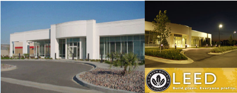
Our Cabazon, California plant was the first food manufacturing facility in the U.S. to earn the Silver LEED (Leadership in Energy and Environmental Design) Certification from the U.S. Green Building Council. The first U.S. food manufacturing facility to achieve LEED Certification was our Mecosta, Michigan facility. Learn more about LEED at www.usgbc.org

Both at its spring sites and its bottling plants, NWNA's environmental policy mandates, at a minimum, strict compliance with environmental regulations at federal, state and local levels. It also meets stringent internal standards for environmentally-sound business practices.